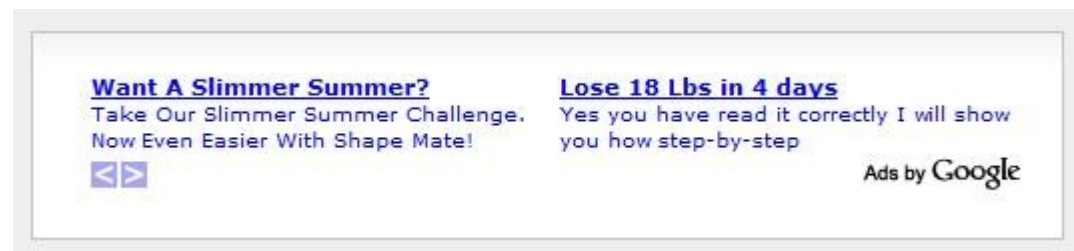
These Are The Type Of Ad Boxes We Use

If your website was promoting a CPA offer in the legal niche for instance, these ads could certainly be worth dollars rather than cents and may even generate more cash than the main offer itself!